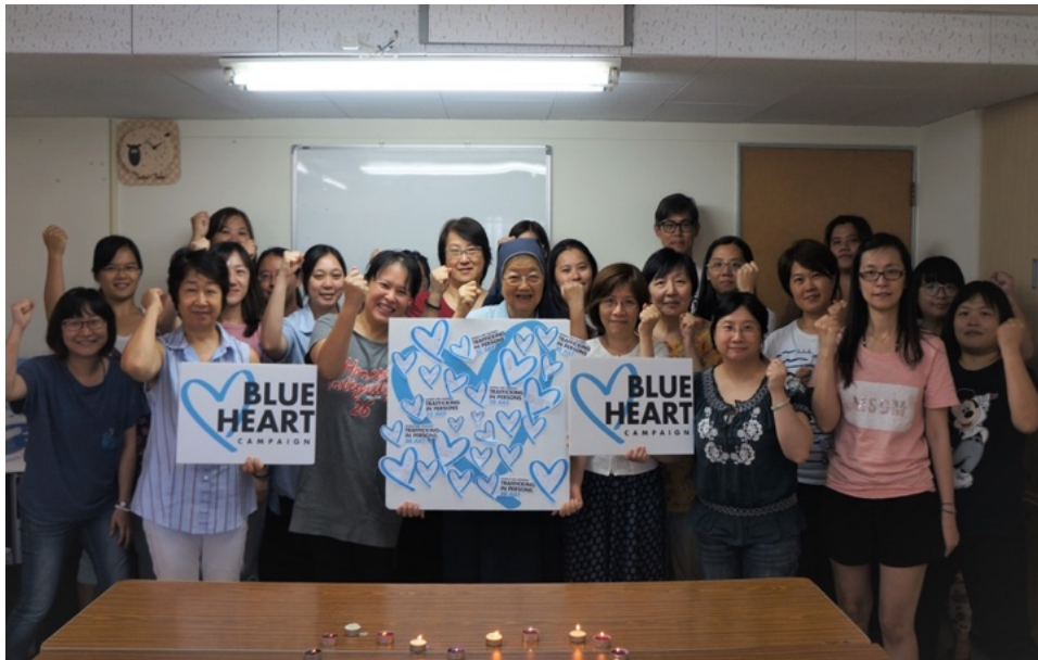
Taiwan GSS members call for the elimination of human trafficking in July 2018