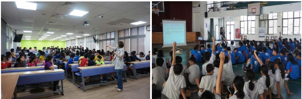
Workshops in schools

We have also made much effort to campaign against Human trafficking among the most vulnerable populations of youth and women. This year, the goal is to teach children (girls) how to avoid becoming victims of human trafficking. We organized workshops in schools to educate teenagers on the facts about human trafficking, labor exploitation, and sexual exploitation, especially efforts to lure girls into prostitution and using drugs to control these girls to make them continue as victims. Our hope is that they will learn to recognize behaviors of human traffickers and understand how to protect their own safety and rights.