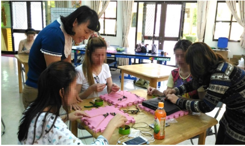
Shelter for TIP survivors