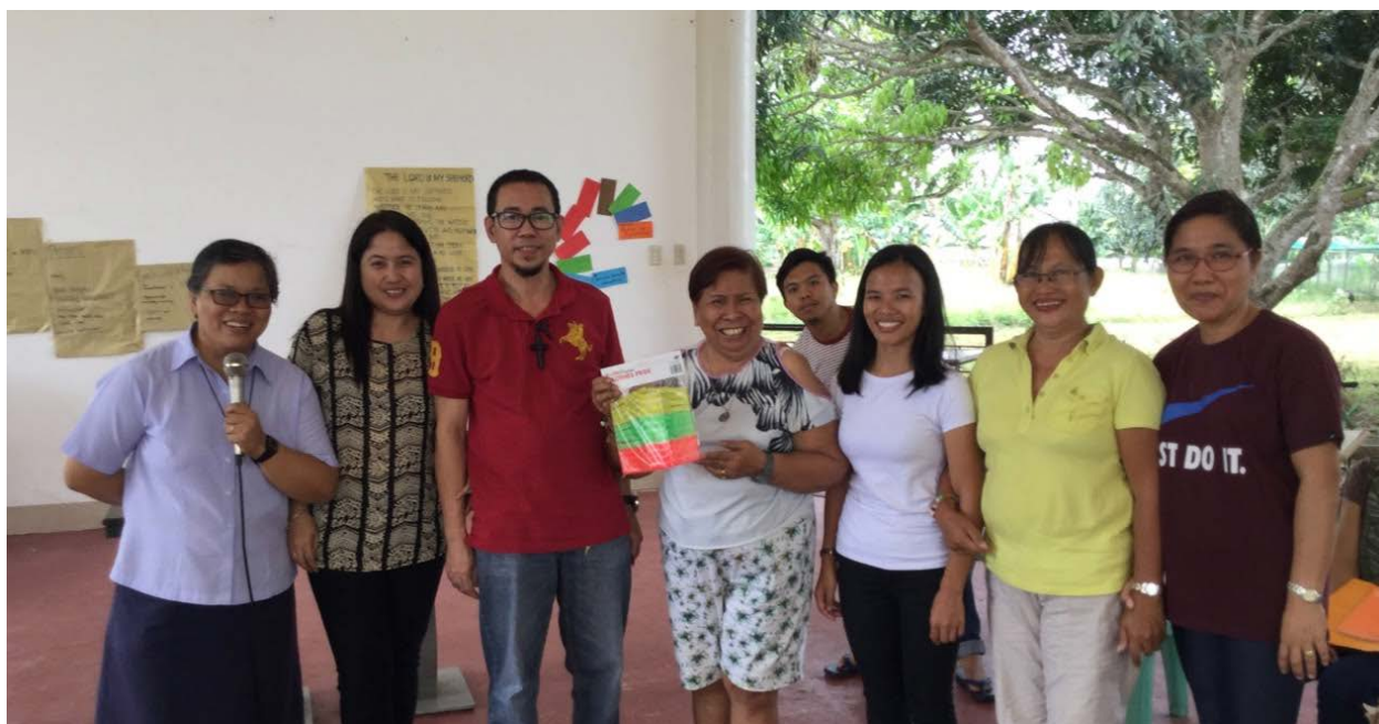
A pose with the first batch of MDP participants during the workshop.