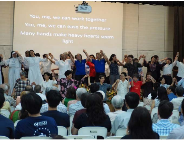
Together, we can safeguard our children!