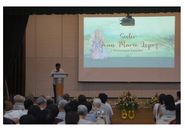
during her speech