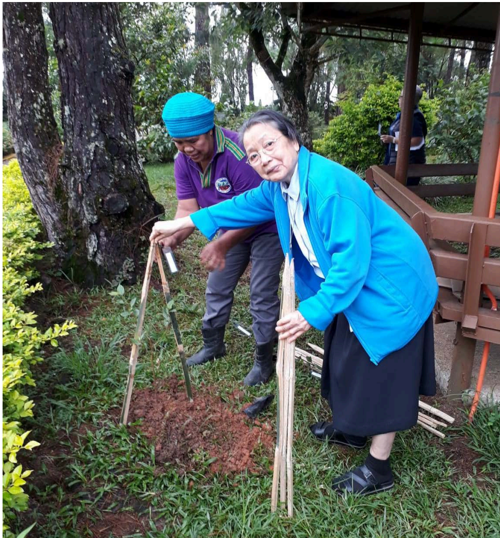
Our tree planting today is one response we are taking to care for Mother Earth.