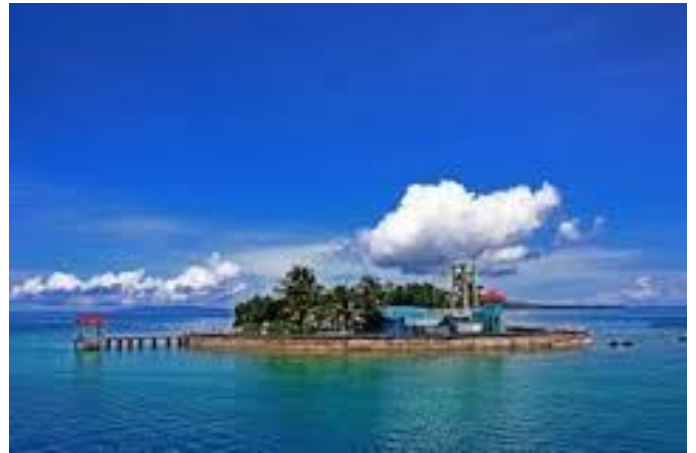
Victory Island, Guiuan, E. Samar

Victory Island does not have its water system. They used rain water for bathing and laundry. They buy drinking water from the neighboring islands for PhP 25 per gallon. Over the years, it has been the dream of the residents to have their own drinking water system. With this situation, the province explored the possibility of providing this basic need.