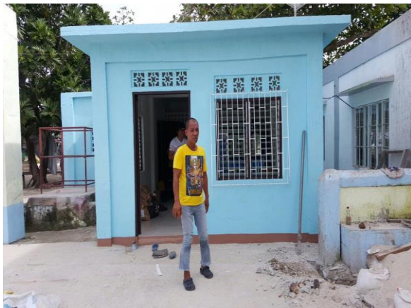
Water refilling station