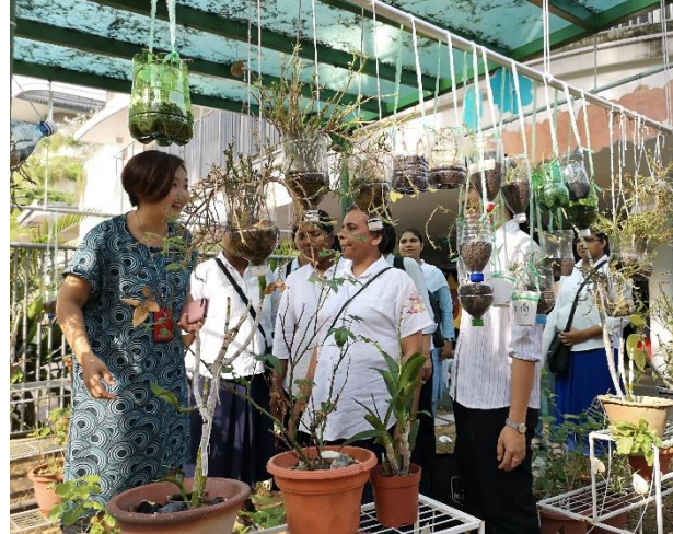
Eco Garden of Marymount Kindergarten