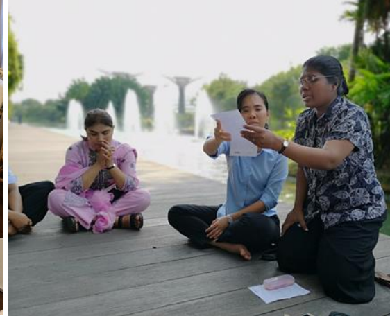
Morning Prayer amidst nature

During our English lessons, we learnt tenses and practiced using the language through speaking, writing and listening. We were also given assignments on the different topics. Our teachers were lay mission partners who were full of zeal in the way they taught us English, as well as vocabulary.