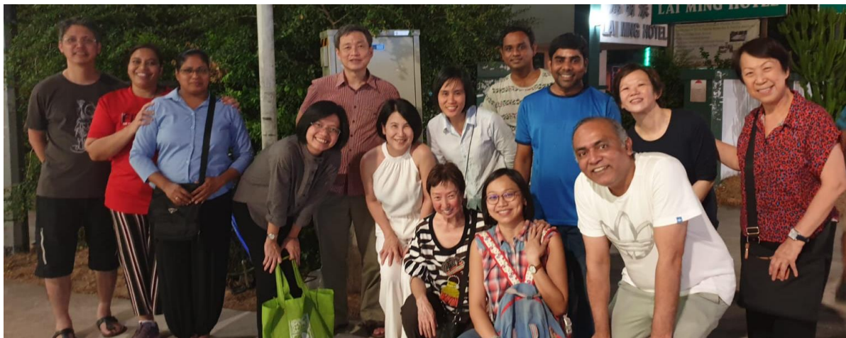
Taking part in the Peace Prayer Outreach

I would also like to share with you our outings. On the very first day after our session, we went to the airport and visited the Jewel @ Changi Airport. It was a very beautiful place with lots of greenery and even a waterfall which we all enjoyed very much. After the scenic walk, we had delicious dinner at a Chinese restaurant. We also went for a tour of Singapore and visited different places of worship such as, the Cathedral of the Good Shepherd, the Armenian Church, Sultan Mosque, Thian Hock Keng Temple and the cultural heritage centres of the Indians, the Malays and the Chinese communities. We saw and learned how in Singapore people of different race and religion lived harmoniously with one another, respecting each other's culture and religion. We ended the day with Mass at the well-known Novena Church.