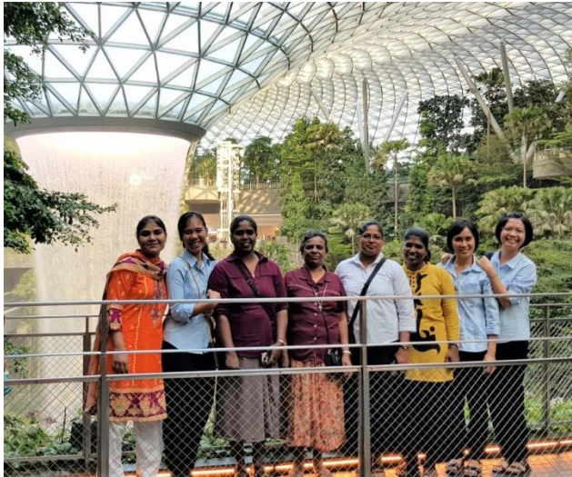
Jewel@ Changi Airport