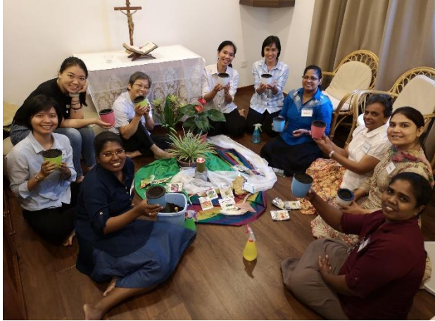
Morning Prayer at the Chapel in Restful Waters