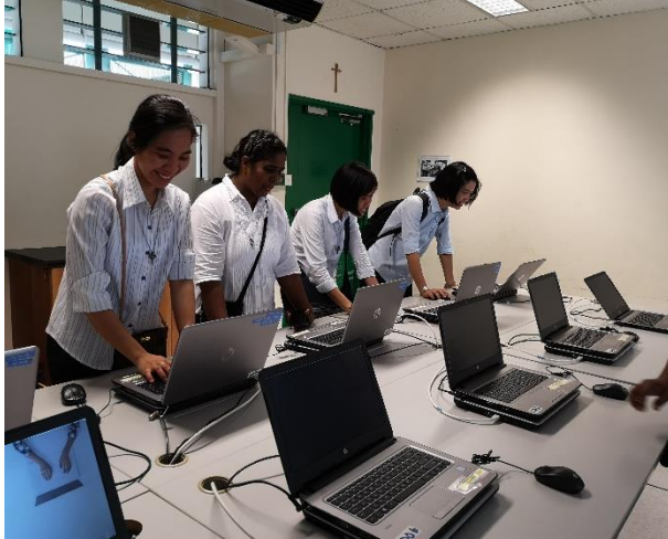
Computer Room of Marymount Convent School

We had the opportunity to visit the Good Shepherd ministries in Singapore. We were all inspired by the sisters and their commitment. We also had a session on the story of the cosmology and human transformation. It helped us to think of creative ways to use the natural resources carefully, especially water.