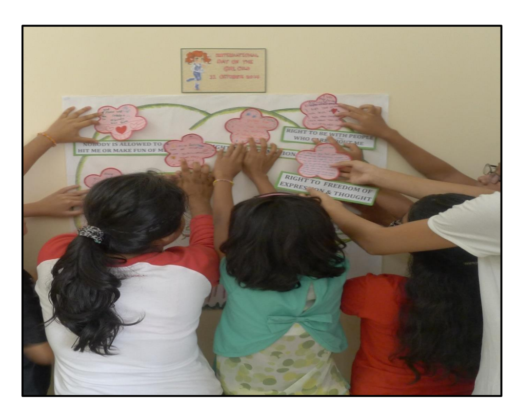
The children mark International Day of the Girl Child by putting up their prayers or wishes for girls across the world