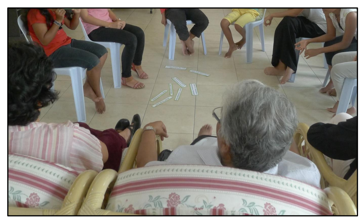
Group discussion among the children and teachers regarding child rights

Challenges are part of life but for the team at RVGSC as well as for the children it is a daily adventure of learning and change.