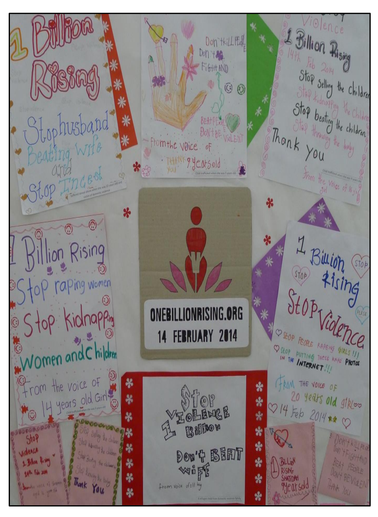
Children speak from their own experience of violence