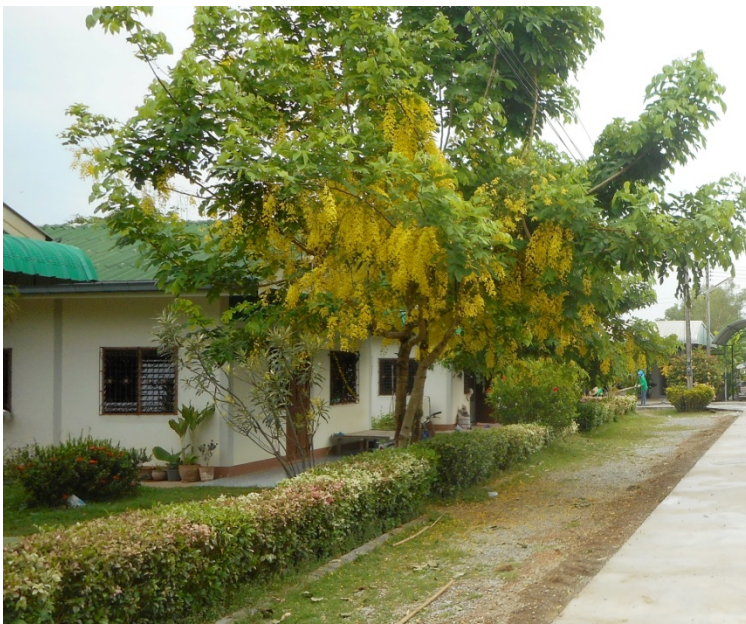
Family homes for long term residency

Left: The original Care Facility with five patient rooms (11 beds) now used for critical care cases requiring more medical supervision Right: The new facility for mobile patients who still require assistance with administration of drugs, physio therapy and personal health care, are accommodated in two dormitories.