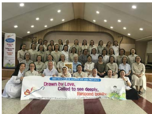
Pre Chapter in Korea