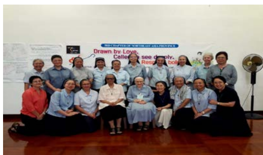
Pre Chapter in Hong Kong for China Region