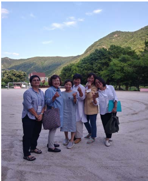
Lay Mission Partners in Korea