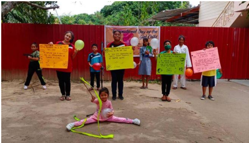
Children of ALC HOPE

We are especially grateful to the teachers, who helped in organising the activities and in the process learned about the rights of the girl child.