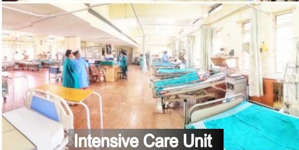
Intensive Care Unit