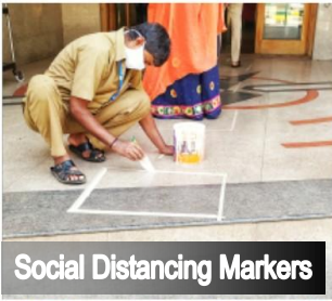
Social Distancing Markers