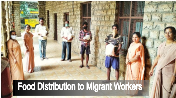
Food Distribution to Migrant Workers