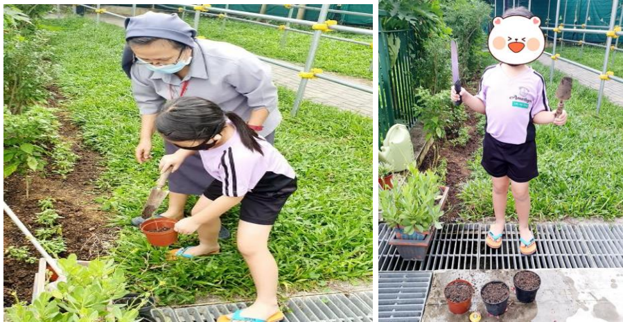
Planting is fun!

Sr Goretti introduced different tools needed for planting to the children and taught them what are needed for plants to grow. The children could not contain their excitement to dig the soil and grow some spring onion plants. It was an enjoyable and enriching session for all on this special day.